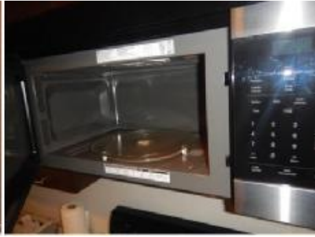
Yes = DID NOT TEST. The evaluation of built-in microwaves is beyond the scope of this inspection.